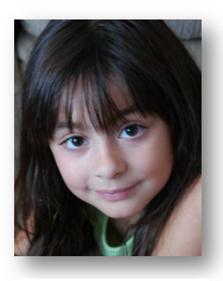
(Return to Front Page)